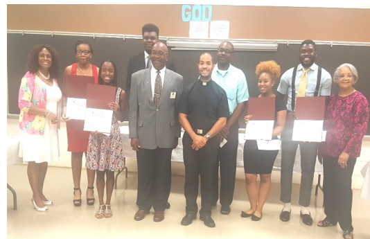
2017 Scholarship Awards